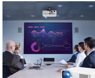
CRYSTAL CLEAR IMAGES in bright environments