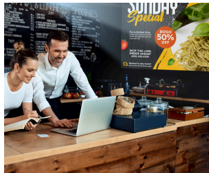
4,500 ANSI LUMENS and SVGA resolution