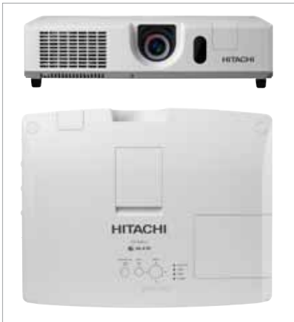
Aspect Ratio 4:3