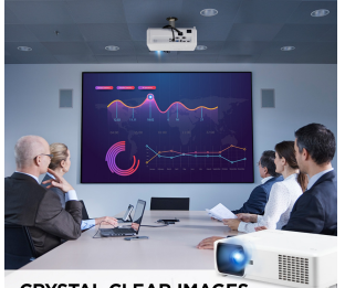
CRYSTAL CLEAR IMAGES