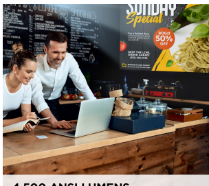
4,500 ANSI LUMENS and SVGA resolution